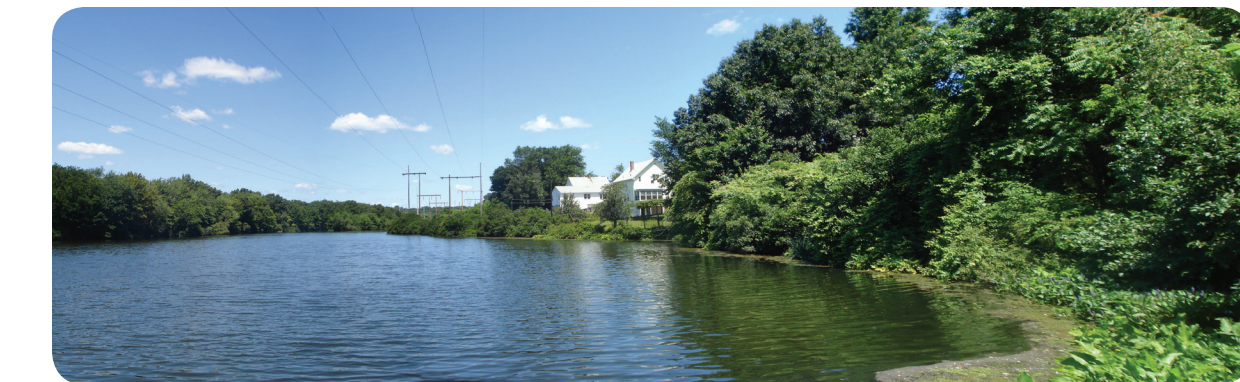
Canada Pond, a 20-acre man-made pond, once supplied water for the nearby mills but is now a wildlife conservation and recreation area.