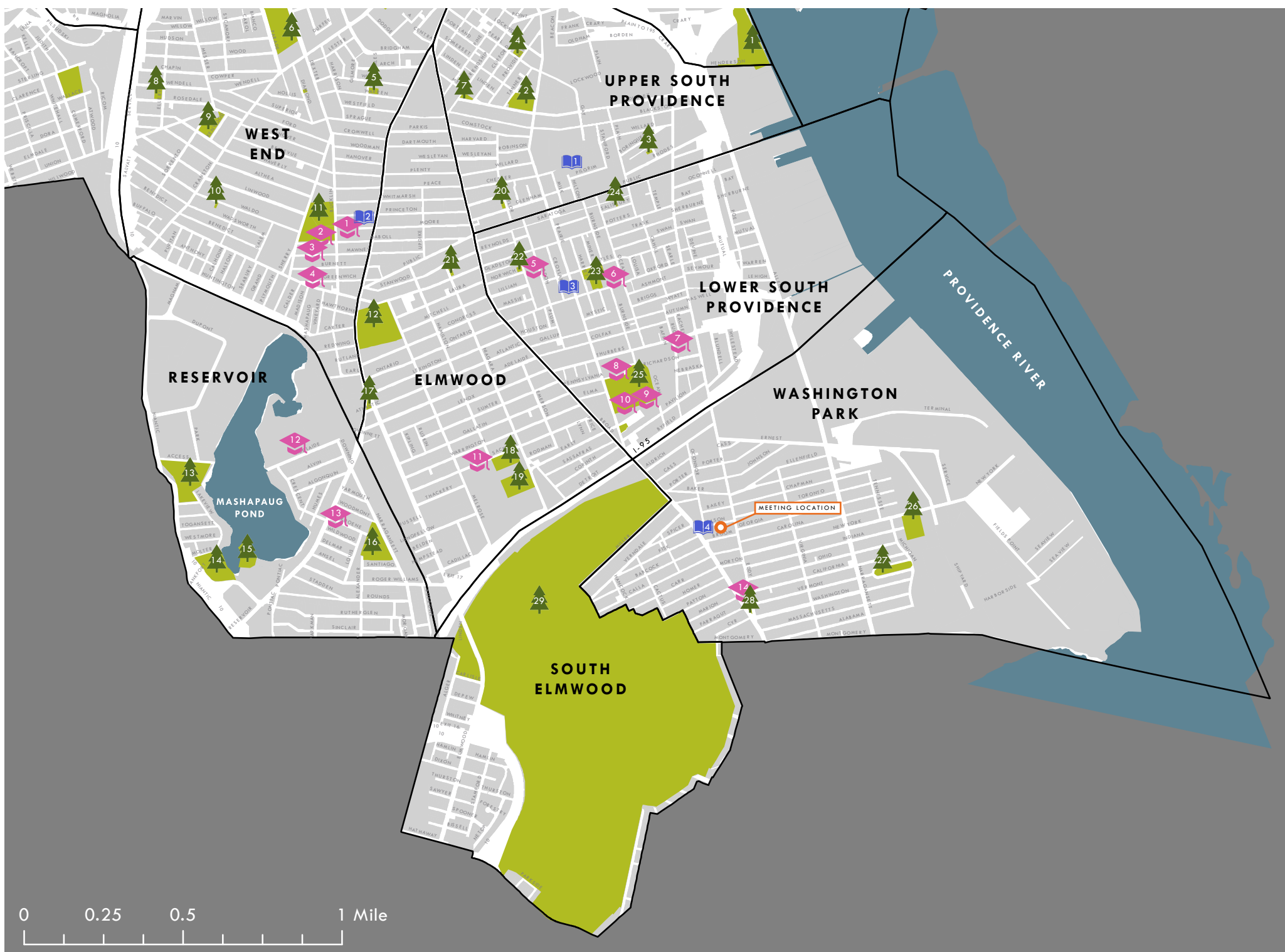
COMMUNITY CONVERSATIONS WASHINGTON PARK COMMUNITY CENTER