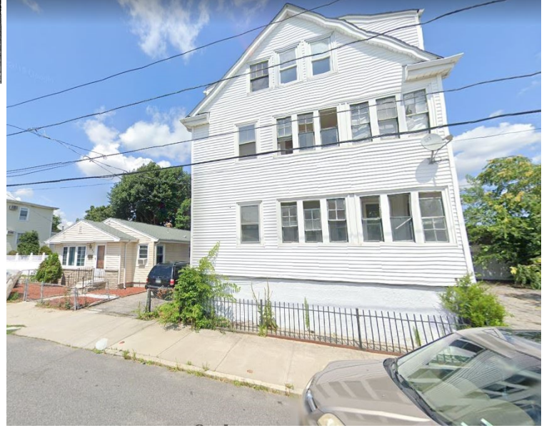
View of the site from Yorkshire Street