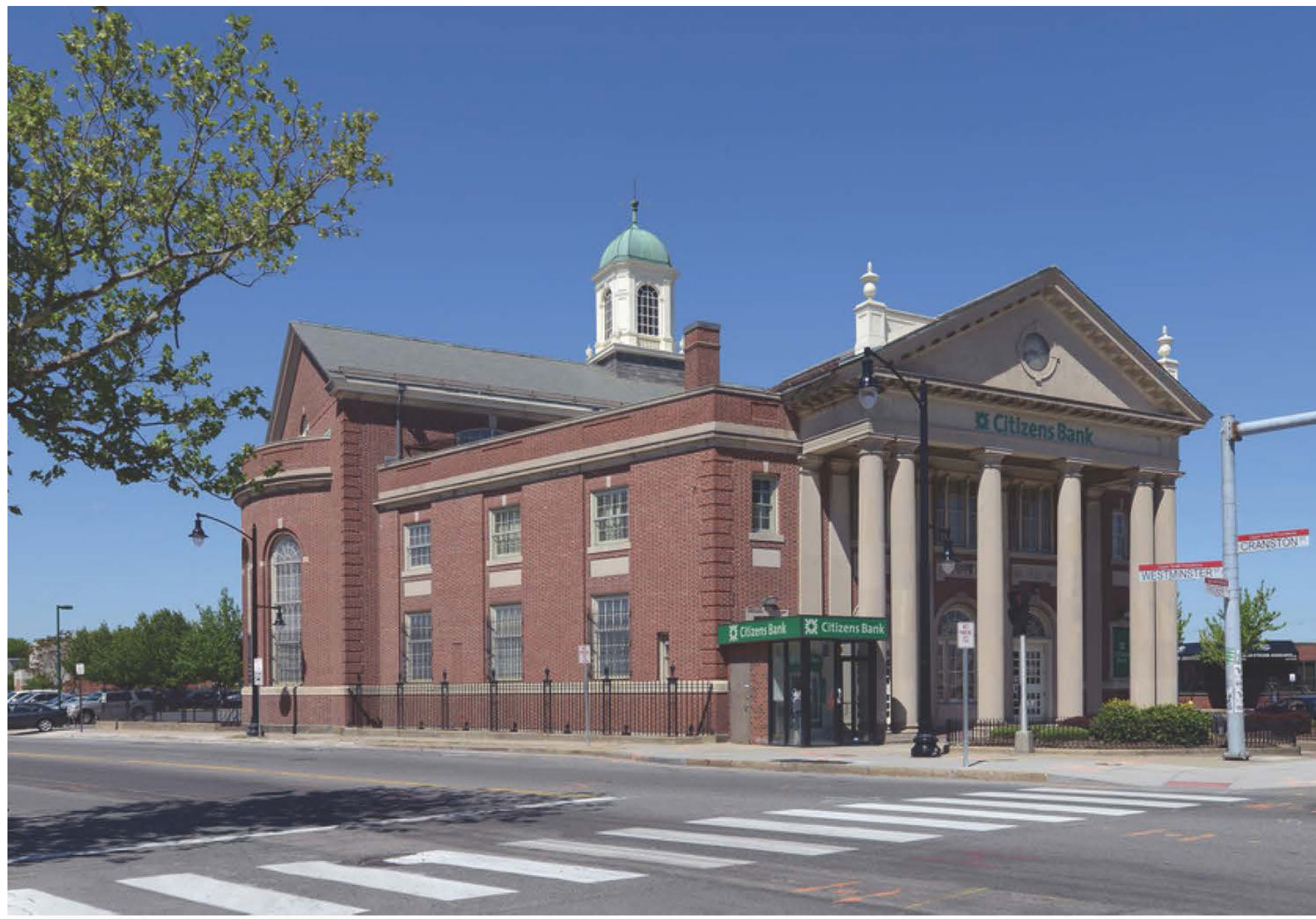
ADAPTIVE RE-USE COMMERCIAL BUILDING