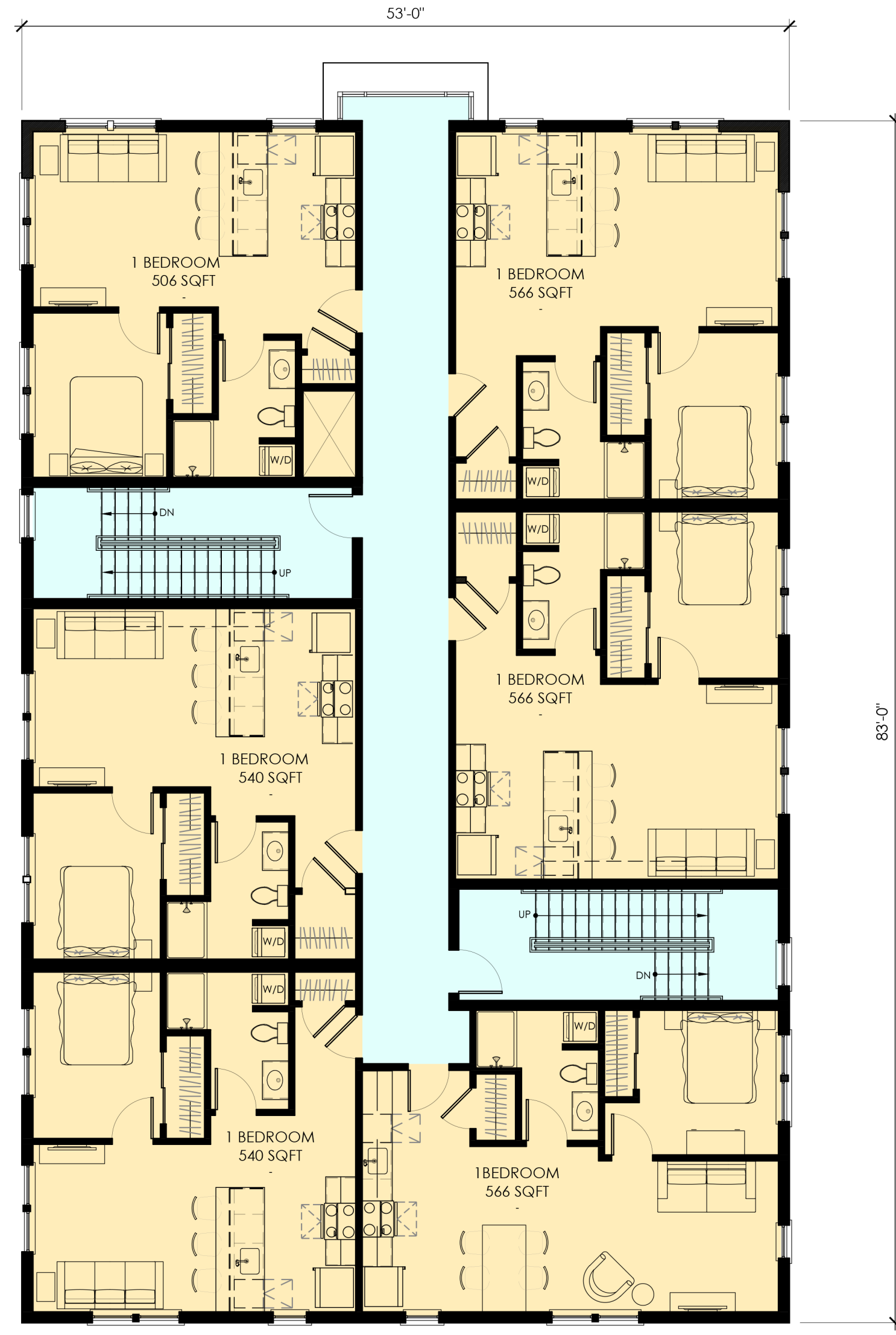
SECOND AND THIRD FLOOR PLAN