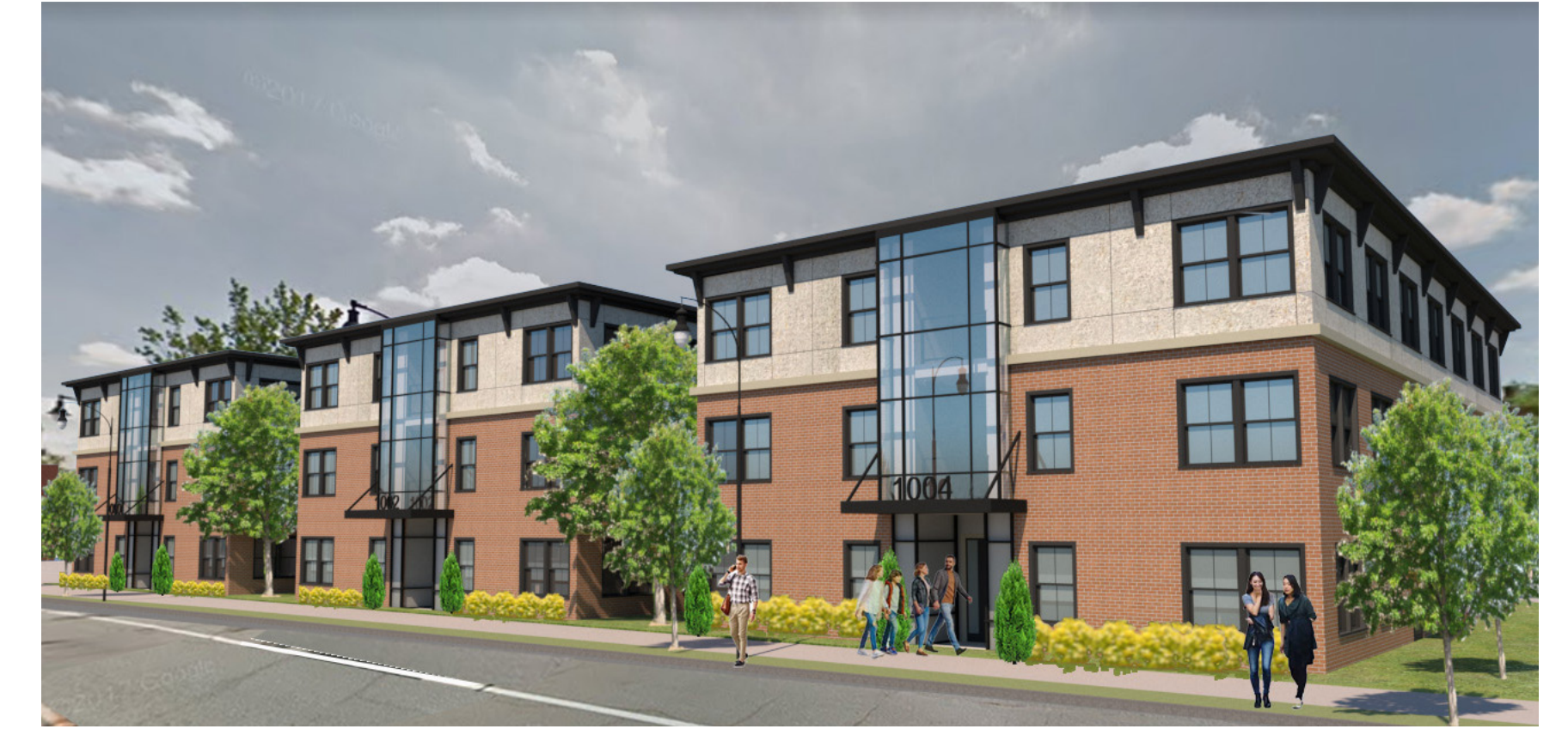
PROPOSED RESIDENTIAL BUILDINGS