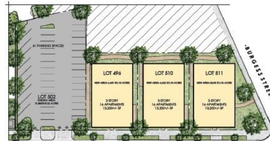
Proposed building floor plans and site plan