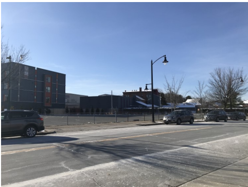
View of the site from Westminster Street