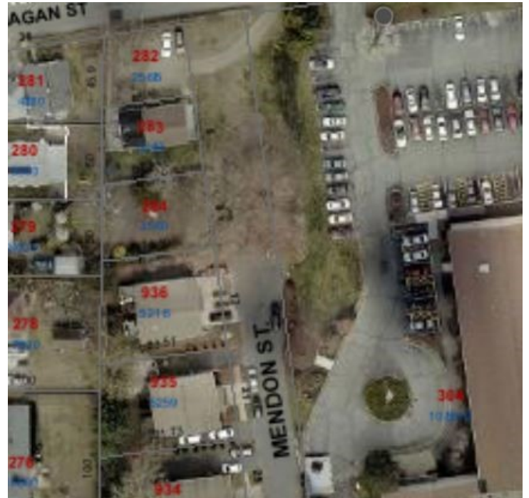
An aerial view of the abandonment area