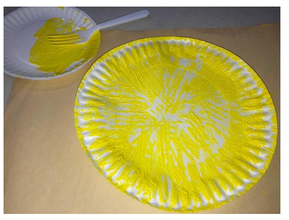
While the paint is drying, cut the fins, eyes and mouth from the construction paper.