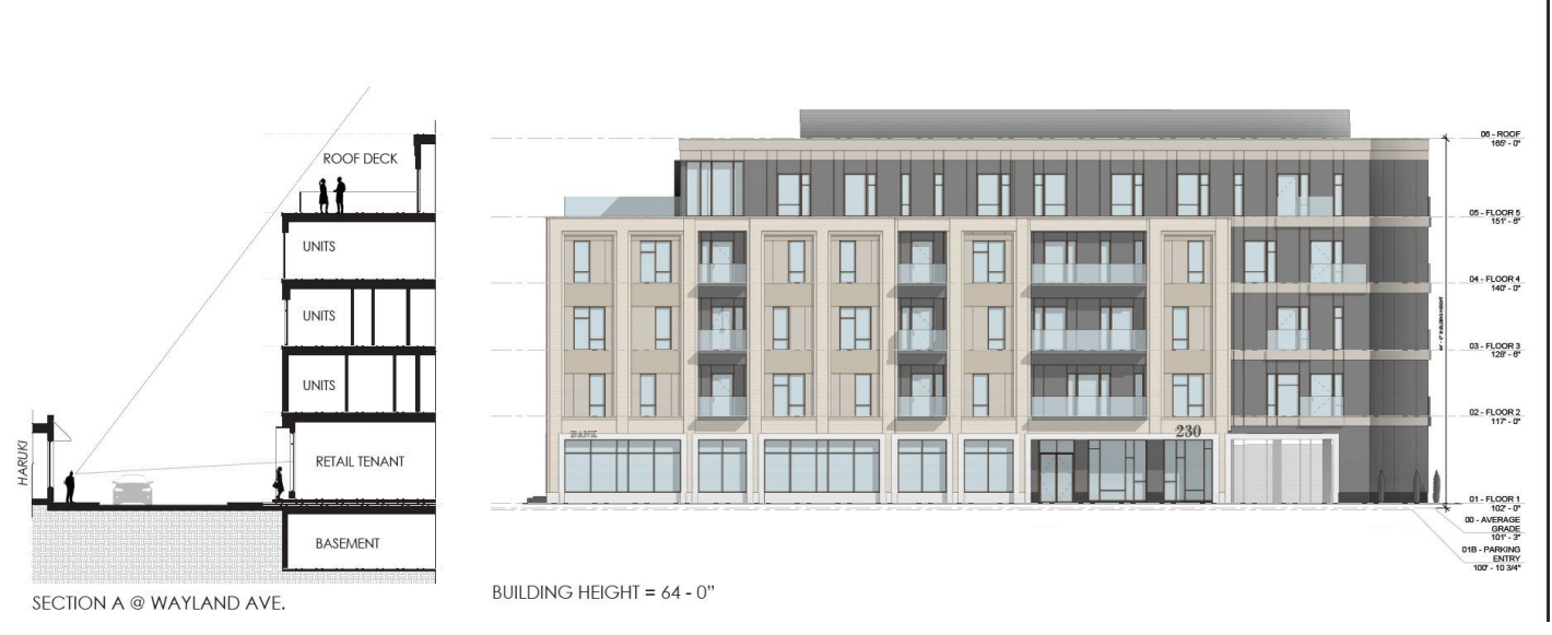
Project Section and South Elevation