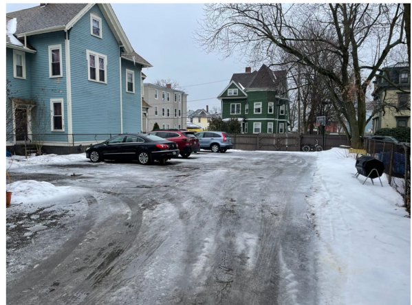
View of the rear yard