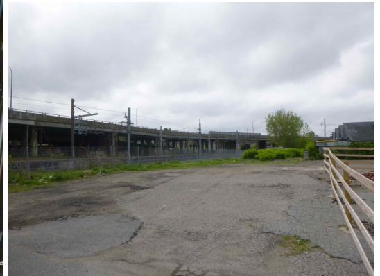
A view of the site from Dike Street