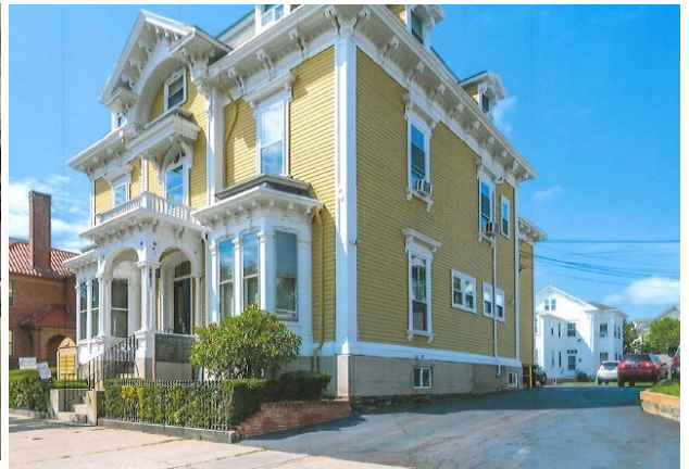
View of the building