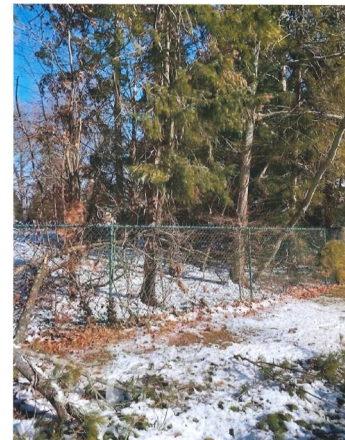
View from Slater Ave