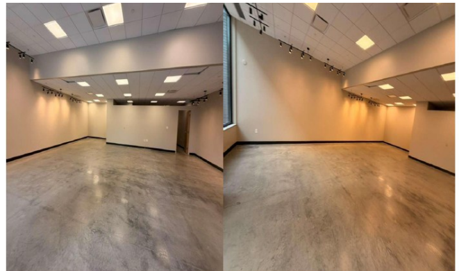
View of the interior