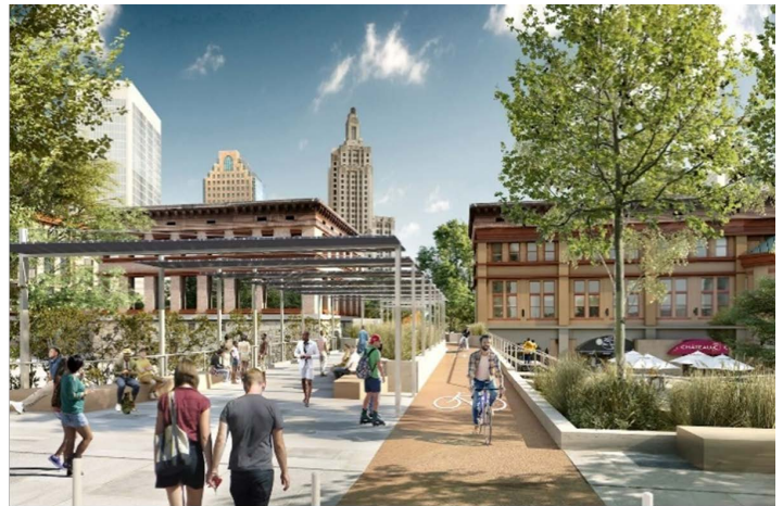
Figure 1: Rendering showing the new bicycle and pedestrian bridge proposed as Phase 1 that will connect Riverwalk to planned development and investments in Kennedy Plaza, replacing two flooded and unsafe pedestrian tunnels.

Mayor Jorge O. Elorza | City of Providence