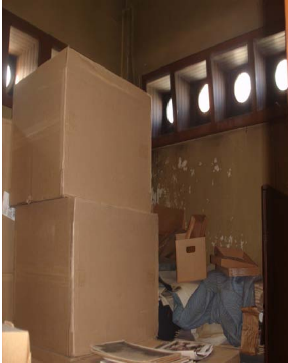
Graphics Room 2010