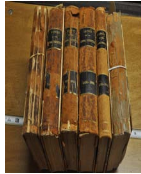
School Reports Before