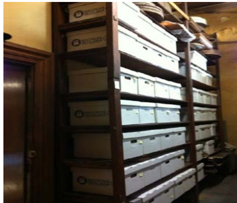
19 th Century Aldermen Records

In addition, major collections of 19 th and early 20 th century City Council and Board of Aldermen records were scattered throughout the archives storage areas and were unavailable for research. During the summer of 2010 the Archivist instituted a program to recruit volunteers to begin processing these important collections. Close collaborations have been formed with the MET School, the West Bay Collaborative, and Providence College. A recent call for volunteers was highly successful, attracting librarians, a retired teacher among others to assist us with various tasks. Currently nine volunteers are working on various projects to improve access to the archives' collections.