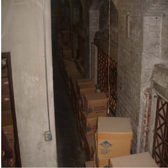
Atrium Storage 2010