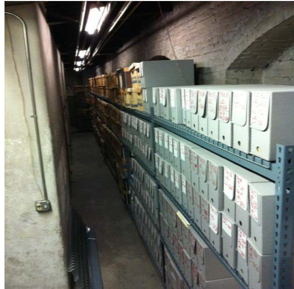
Atrium Storage 2012