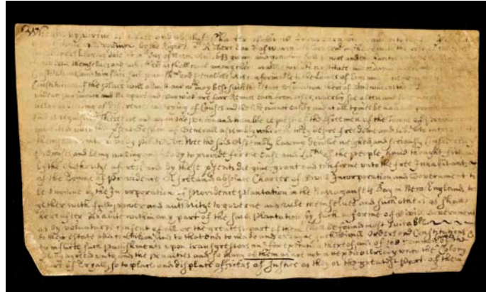
Recently Discovered 1648 Town Charter