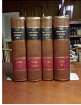
1875 Census After