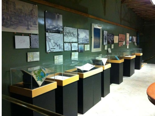
New Archives Exhibit Area

Recently, the lobby entrance to the archives has been transformed into an exhibit area and the “Capital Ideas” exhibit has been re-installed there. Currently, the Archivist is collaborating with Brown University on a new exhibit commemorating Providence’s participation in the Civil War. The exhibit opening is tentatively scheduled for May 2013.