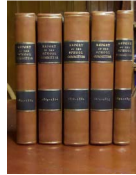
School Reports After