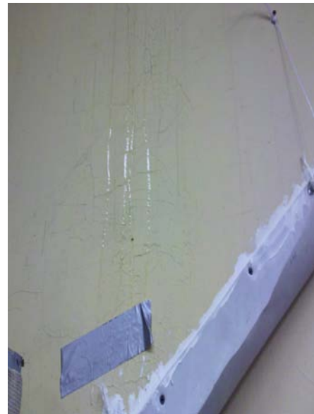
Leaks along Archives Wall