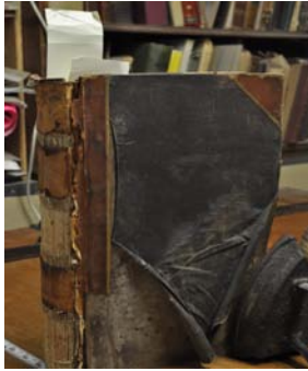
1875 Census Before