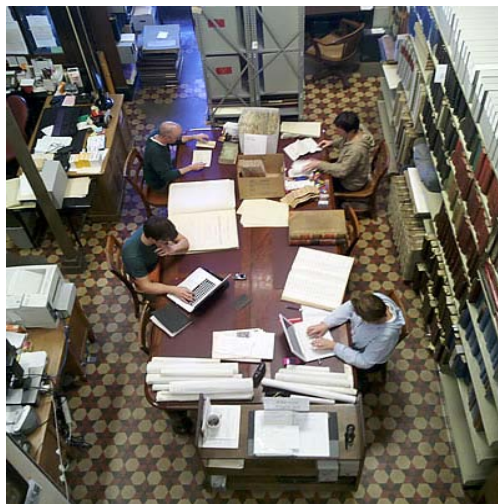
Volunteers at work

The above-mentioned collaborations with the MET School, Providence College and West Bay Collaborative have been mutually beneficial and are expected to continue. In addition, other area colleges have expressed interest in supplying interns and/or work study students to assist the archives. The Archives is also in preliminary discussions with the University of Rhode Island's Graduate Library School with a view towards supplying library school students to assist with