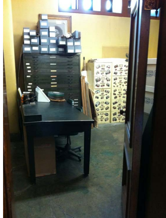
Graphics Room 2012