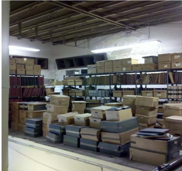
Mezzanine Deck 2010

pursuing the purchase of a dehumidification system designed to stabilize the environment in the archives vault, public research area, as well as the mezzanine and contiguous storage rooms. Controlling humidity levels, however, offers only a partial solution. Optimal conditions require constant temperature and humidity levels (68 degrees F; 50% relative humidity) which would be costly given the present space.