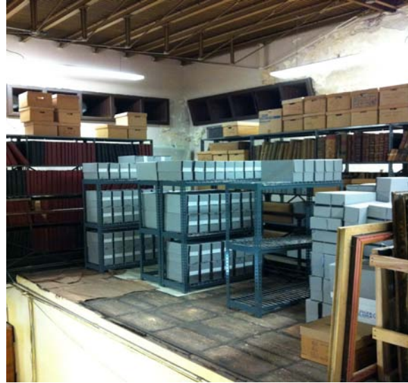
Mezzanine Deck 2012

The inaccessibility of storage areas within the archives was identified as a major area of concern. The Commission noted that several rooms, including the graphics storage area, were so crowded with boxes that entrance into the room was very difficult if not impossible. One “cell” storage room in the Atrium had been locked shut some time ago and the entrance key had been lost. Boxes were scattered about the corridors within atrium storage areas. More than 1,500 boxes of records were stored in basement rooms, some stacked on the concrete floor susceptible to flooding. Water damage was evident to records particularly in the so-called “Assessor’s Room.” Many mayoral portraits were found resting against damp and/or damaged walls along the archive’s mezzanine resulting in damage to canvasses and frames. Boxes lined both walls of the lobby entrance into the archives. In accordance with the Commissions recommendations, the archives staff has: