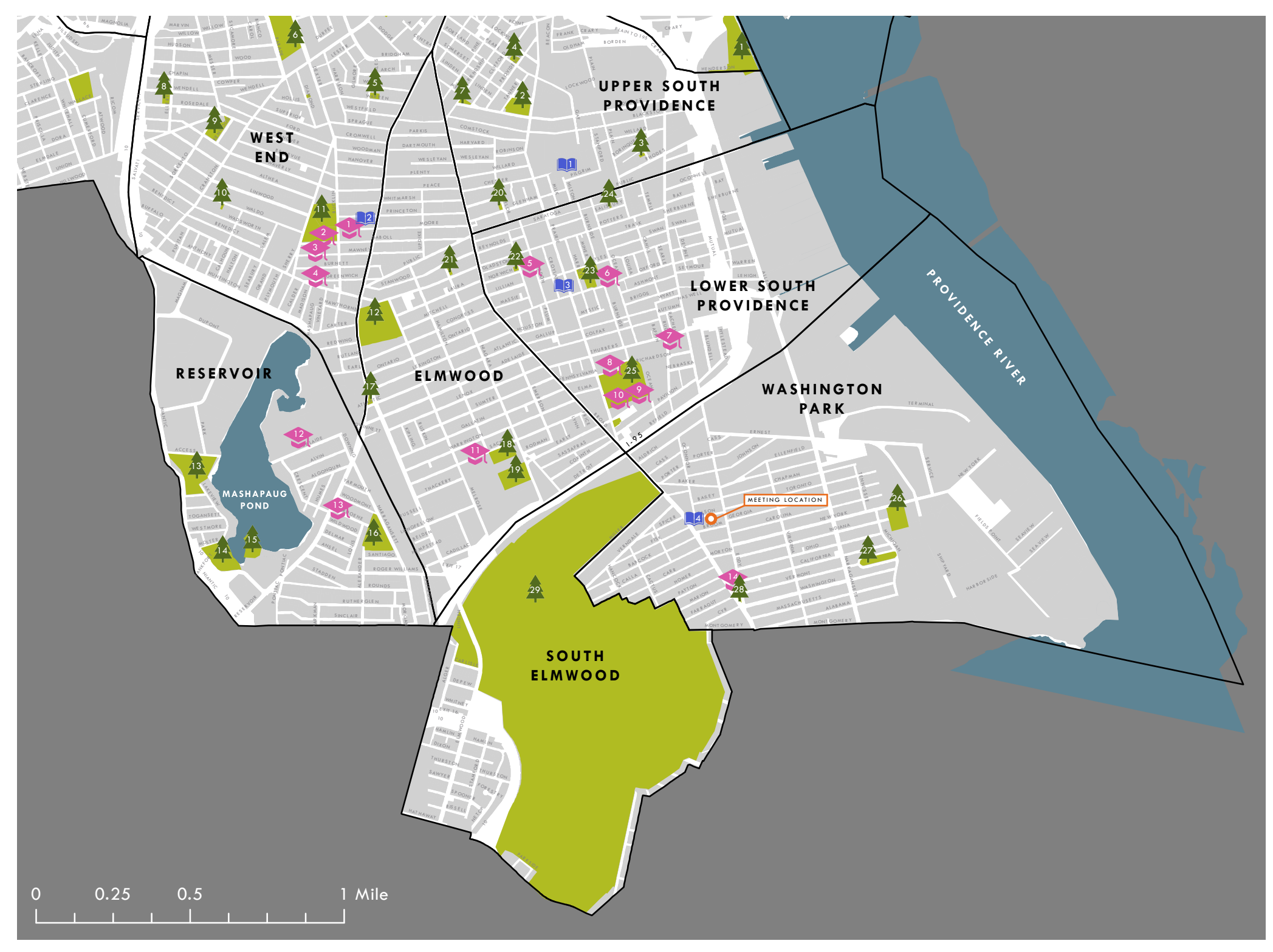
COMMUNITY CONVERSATIONS WASHINGTON PARK COMMUNITY CENTER