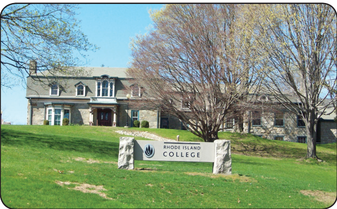
A walking trail could be created throughout the neighborhood, linking various institutions and neighborhood parks to one another.

Work to permanently preserve the open space at Triggs Memorial Golf Course.