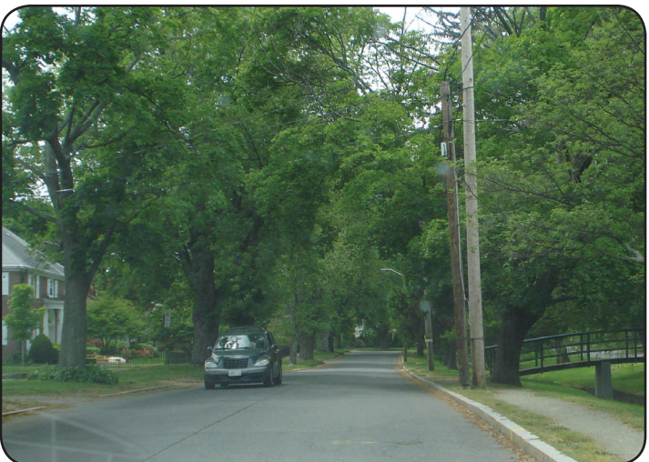
The current two-way configuration along both sides of Pleasant Valley Parkway increases speeding and driver confusion.