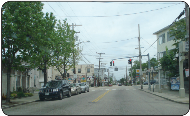
Crosswalks, street trees, lighting, and sidewalks could be improved along Admiral Street.

Work with DPW to evaluate ways to make Admiral Street more pedestrian-friendly.