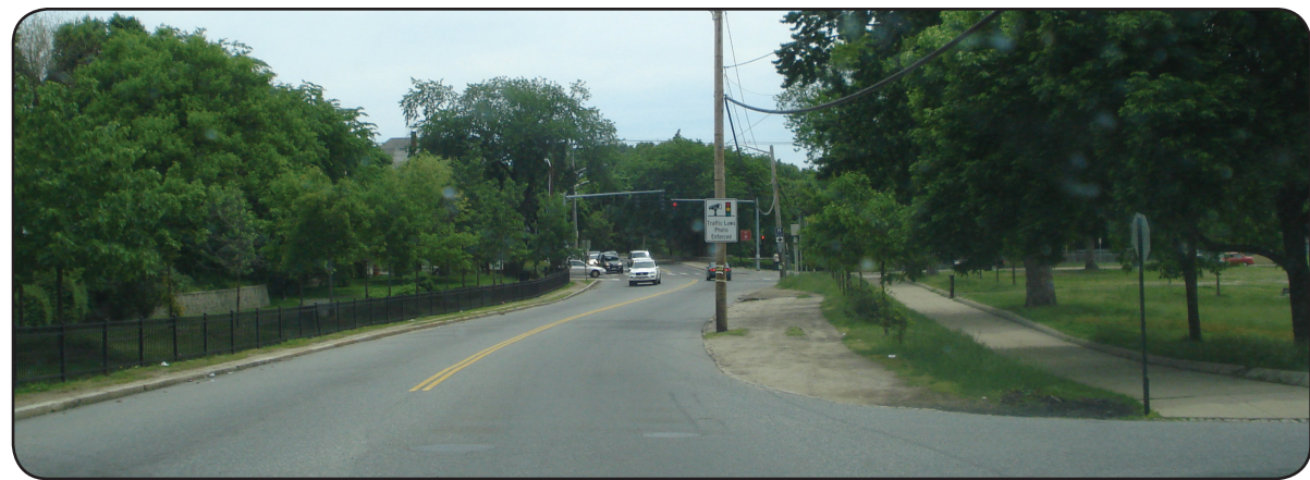
The Oakland Avenue curb line should be restored and lanes should be reconfigured along the edge of Greene Middle School to prevent parking and drainage problems.

Redesign southbound Oakland Avenue to include a drop-off lane, right turn lane, left turn lane, and through travel lane.