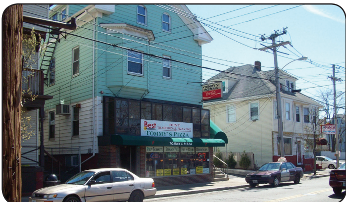
Neighborhood residents expressed a desire to encourage and strengthen existing commercial and neighborhood retail along this portion of Chalkstone Avenue.

Work with Roger Williams Medical Center to improve edges along Chalkstone Avenue and Pleasant Valley Parkway through streetscape improvements and landscape buffers.