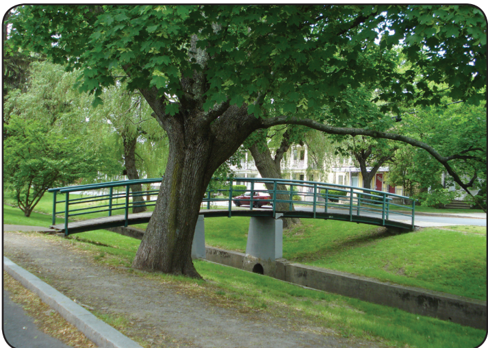
The pedestrian bridges over the creek in Pleasant Valley Parkway are in poor condition and should be repaired or replaced.