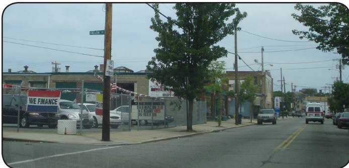
As early as the 1880s streetcar lines were established along Chalkstone Avenue to Smith Street and North Providence; although bus service exists along Chalkstone presently, residents have expressed a desire for more frequent service.

✓ Work with RIPTA to increase the frequency of service along Chalkstone Avenue.