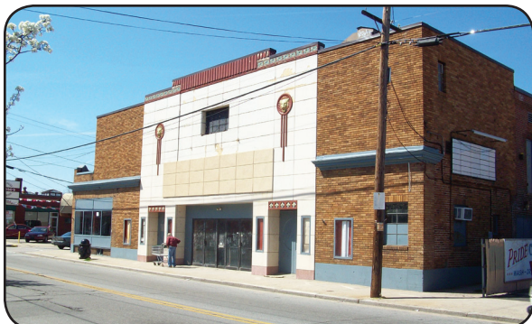
The Castle Theatre is a prominent neighborhood landmark.