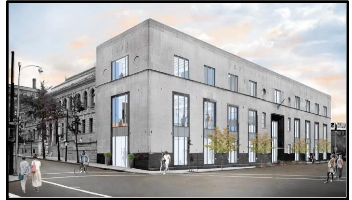
PROVIDENCE PUBLIC LIBRARY