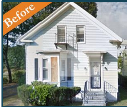
120 Camden Avenue