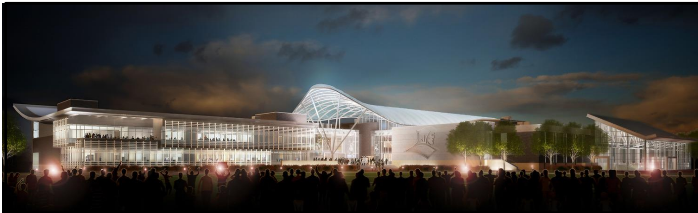
RUANE FRIAR DEVELOPMENT CENTER