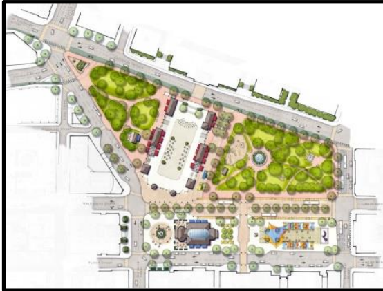
KENNEDY PLAZA REIMAGINING