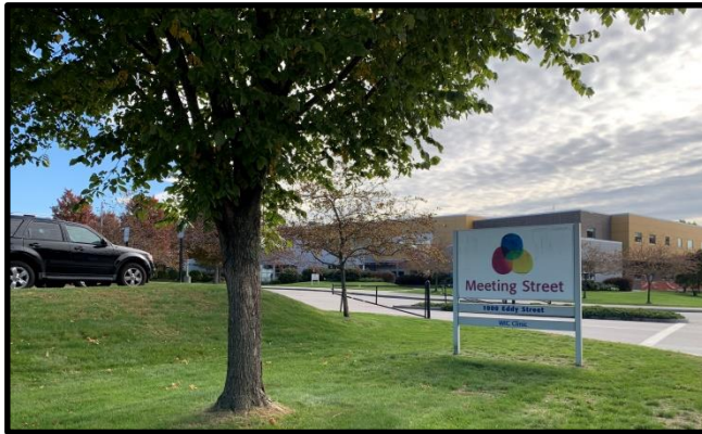
MEETING STREET CAMPUS EXPANSION