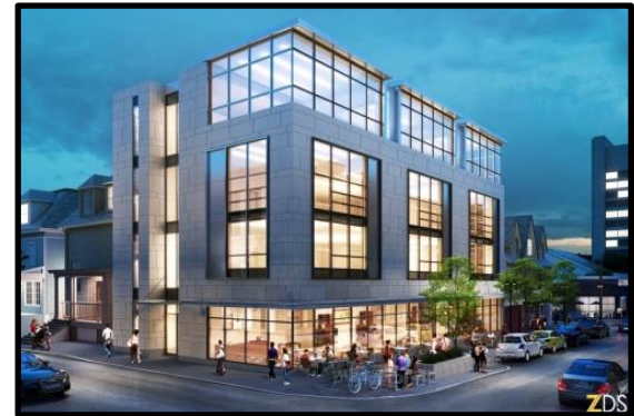
249 THAYER STREET