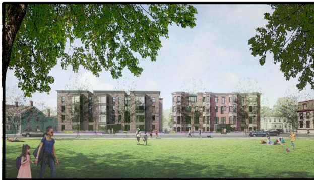
31-45 PARADE STREET