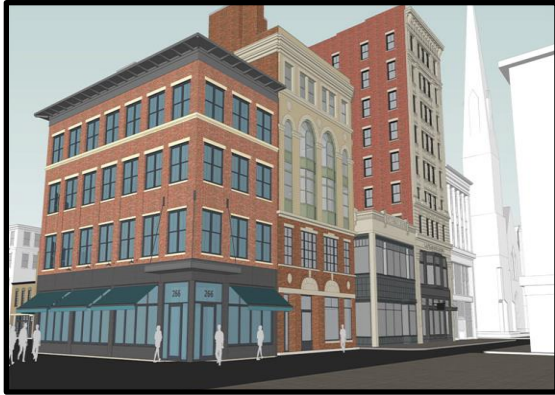
270-290 WESTMINSTER STREET