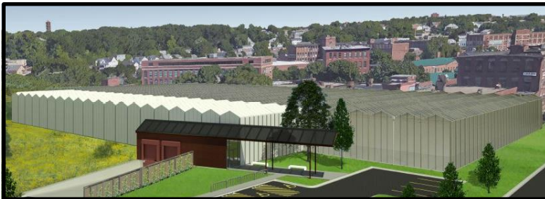
GOTHAM GREENS GREENHOUSE