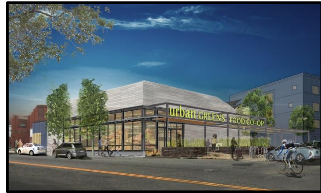
URBAN GREENS & 93 CRANSTON RESIDENCES