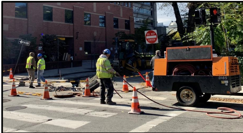
CAPITAL IMPROVEMENT PROJECTS