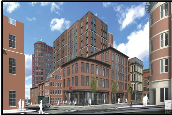
EDGE COLLEGE HILL PHASE II