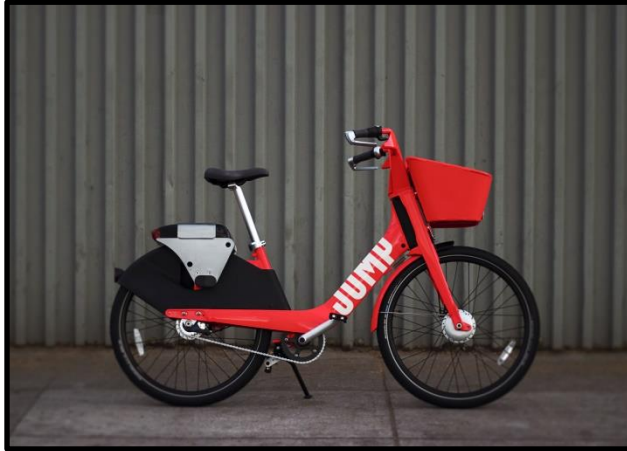
JUMP BIKE SHARE