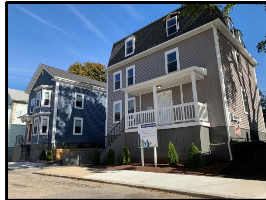
BARBARA JORDAN I & II