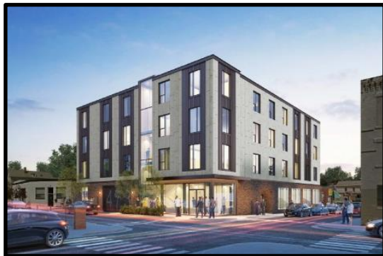
473 WASHINGTON STREET