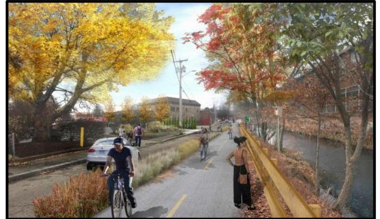
SAN SOUCI DRIVE