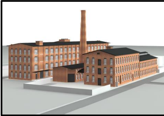
ROOMS & WORKS PHASE 2