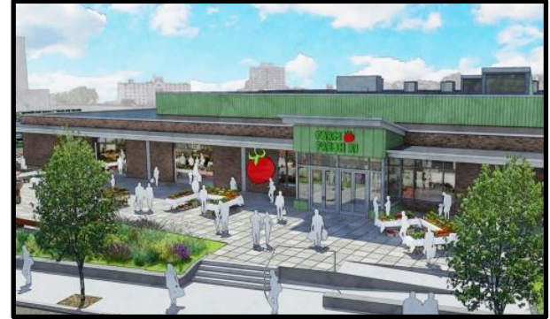
FARM FRESH RI FOOD HUB