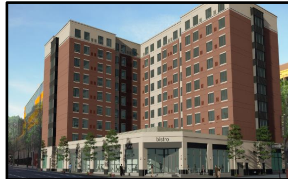
MARRIOTT RESIDENCE INN