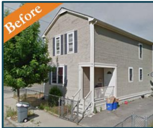
95 Providence Street