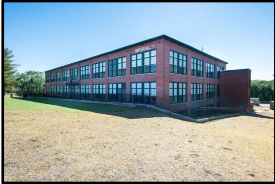
SIXTY KING STREET