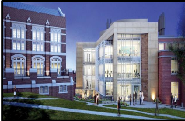
ALBERTUS-MAGNUS SCIENCE COMPLEX