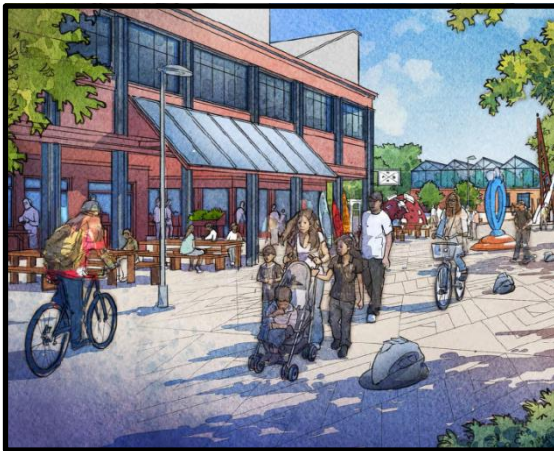
WOONASQUATUCKET VISION PLAN