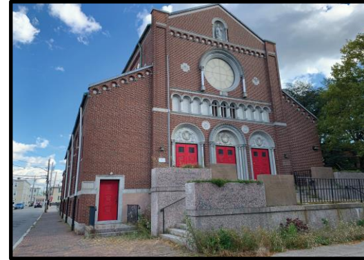
OUR LADY OF MT. CARMEL CHURCH