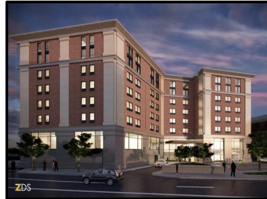
HOMESWOOD SUITES HOTEL