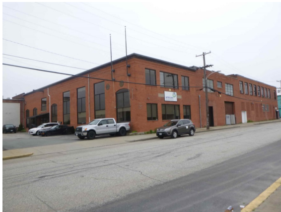
View of the building