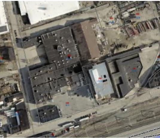
Aerial view of the site