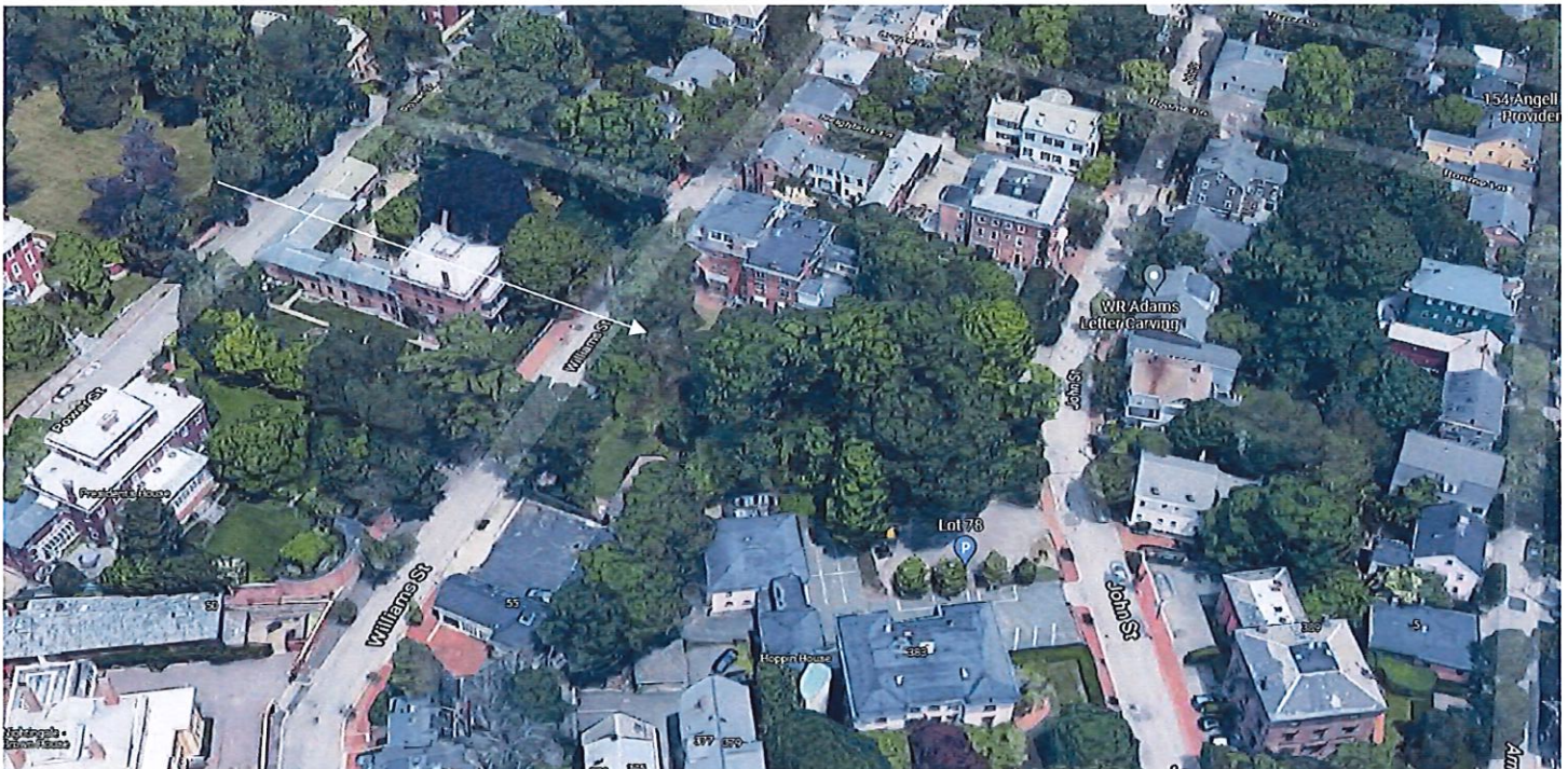
Arrow indicates project location, looking north.