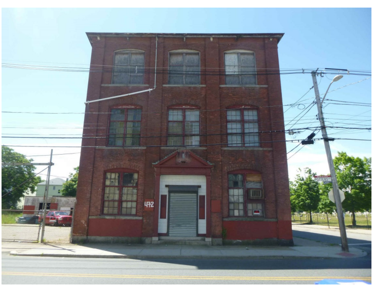
View of the building