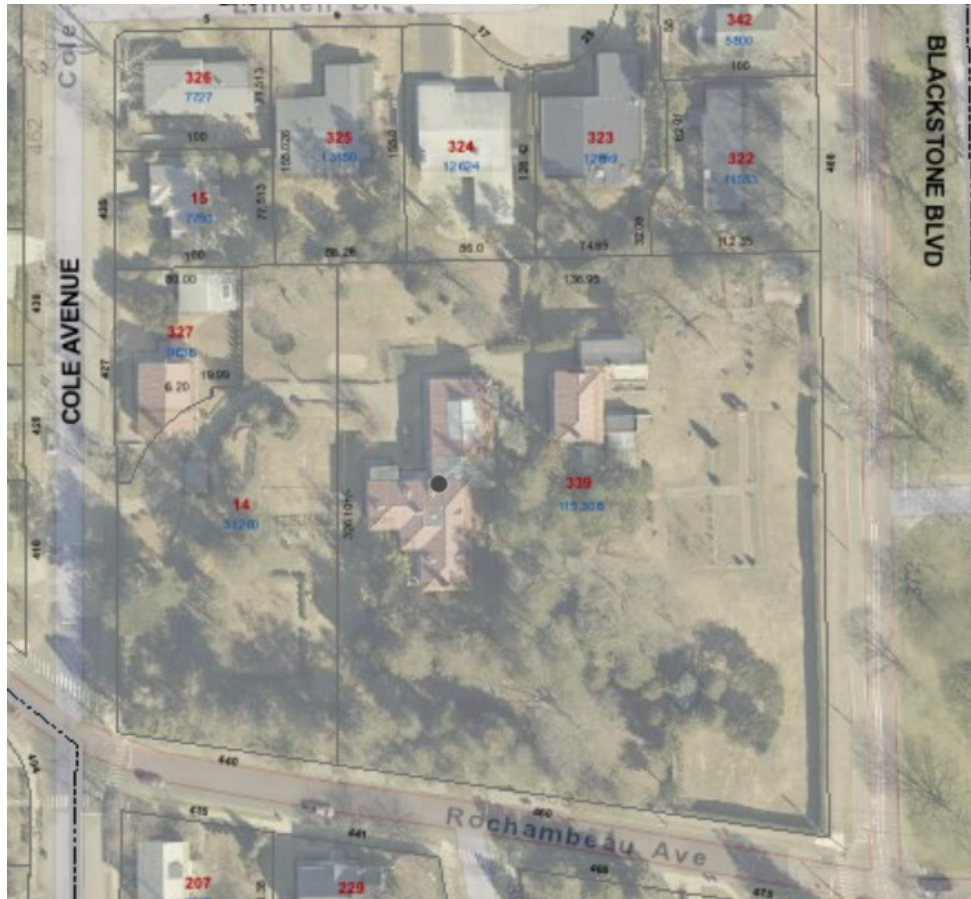
An aerial view of the subject lots