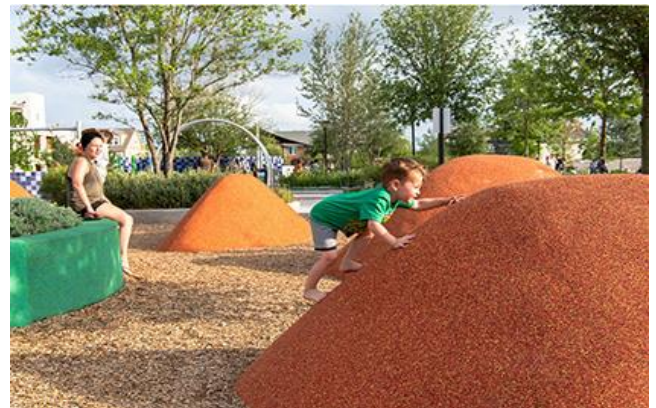
Figure 12: Mary Elizabeth Branch Park, Austin, TX (Design Workshop)