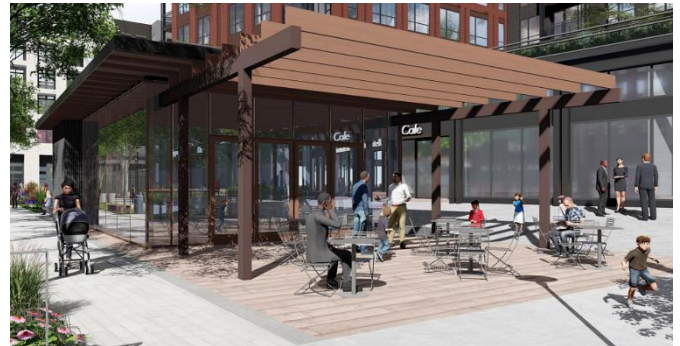
Figure 6: Parks at Walter Reed Concept, Washington, DC (Hickok Cole and Oehme van Sweden)