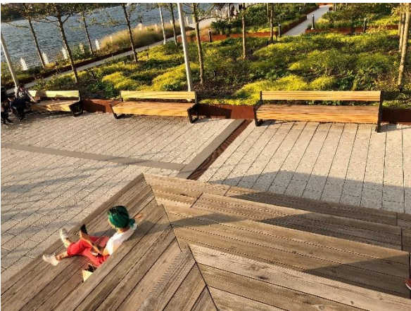
Figure 17: Domino Park, Brooklyn, NY (James Corner Field Operations)