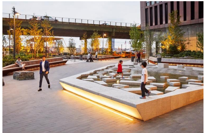
Figure 18: First Ave Water Plaza, NYC (SCAPE Studio)