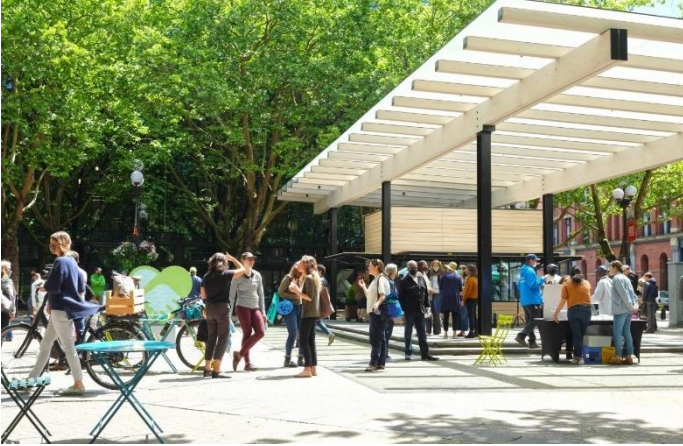
Figure 3: Occidental Park Pavilion, Seattle, WA (Olson Kundig)

Below are several precedent projects that the City is interested in having the Consultant use as inspiration for these improvements.