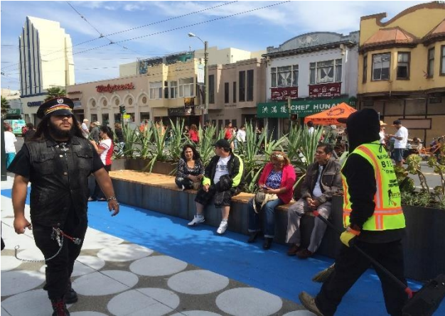
Figure 15: Persia Triangle, San Francisco, CA (Fletcher Studio)