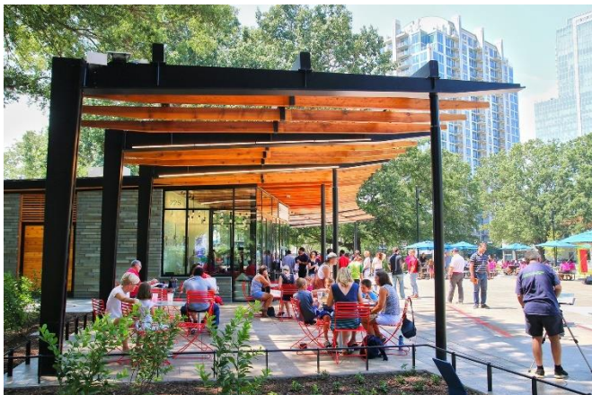
Figure 7: Moore Square, Raleigh, NC (Sasaki)