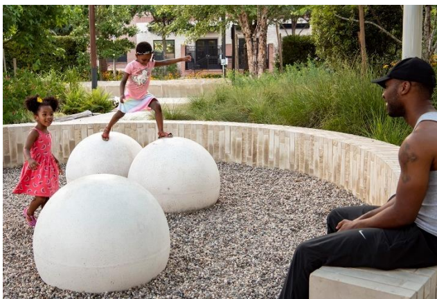
Figure 13: Midtown Park, Houston, TX (Design Workshop)