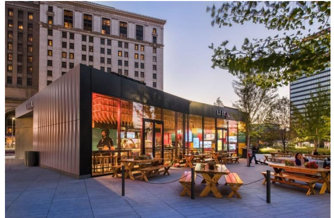
Figure 10: Cleveland Café Pavilion, Cleveland, OH (nArchitects)