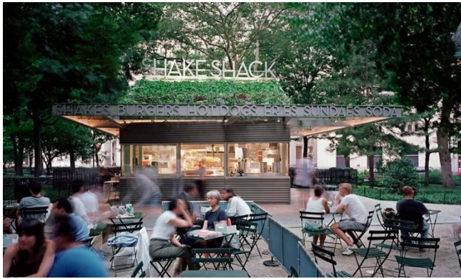
Figure 9: Madison Sq Park Shake Shack, NYC (SITE Environmental)