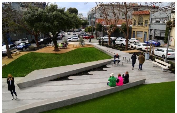
Figure 14: South Park, San Francisco, CA (Fletcher Studio)