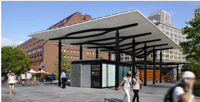
Figure 5: Boston Harbor Islands Pavilion, Boston, MA (Utile Designs)