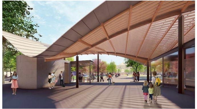
Figure 4: McAllister Pavilion Concept, San Francisco, CA (Kennerly Architecture)