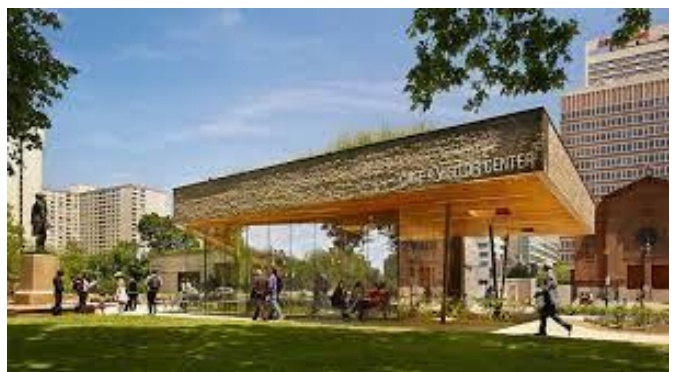
Figure 8: Sister Cities Cafe & Visitor Center, Philadelphia, PA (DIGSAU)