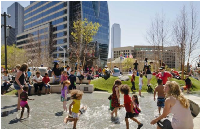
Figure 11: Klyde Warren Park, Dallas, TX (James Burnett)