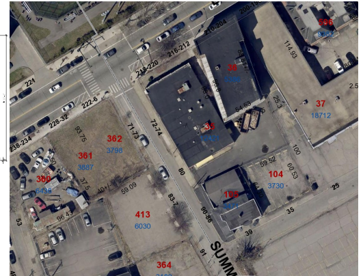
Aerial view of the site