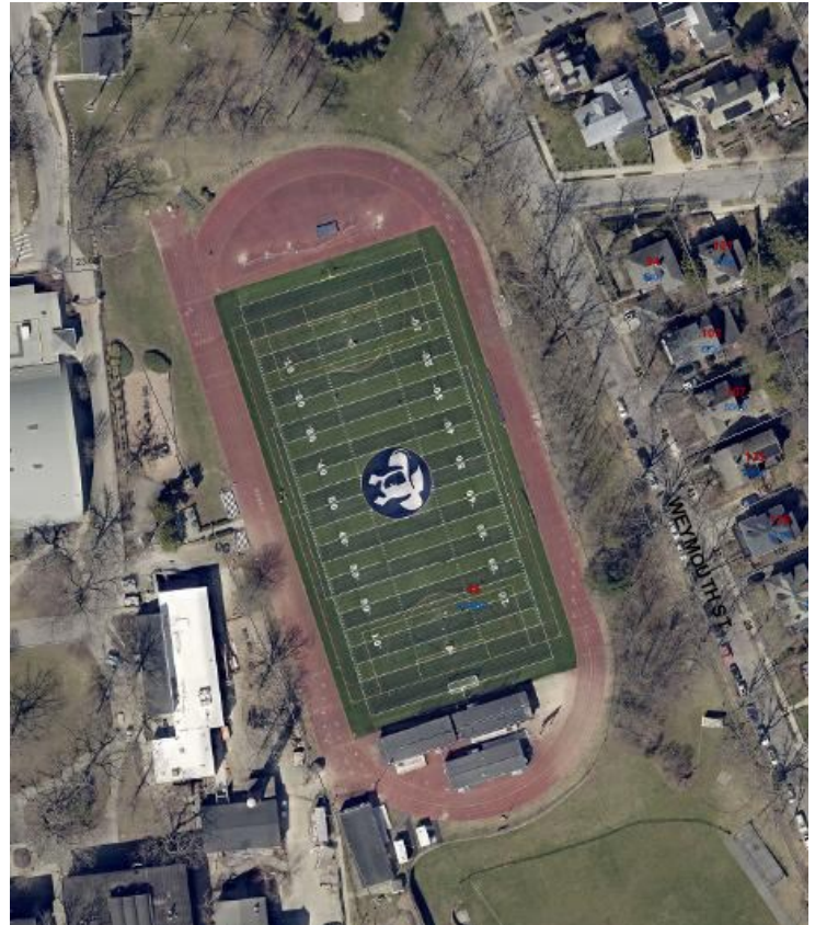
Aerial view of the site