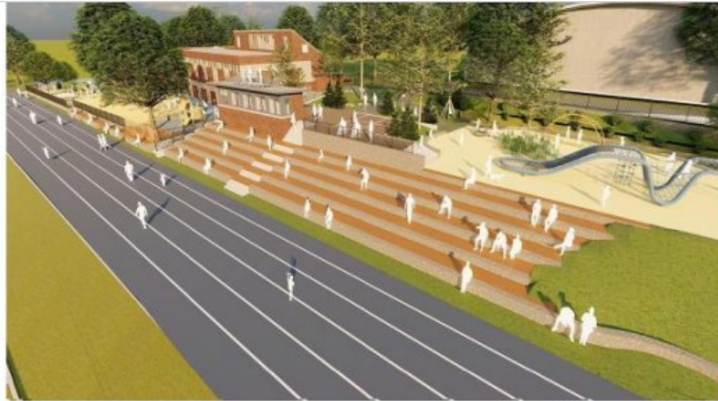
Renderings of proposed changes