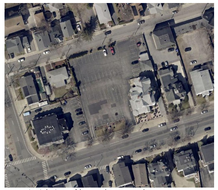
Aerial view of lots to be rezoned