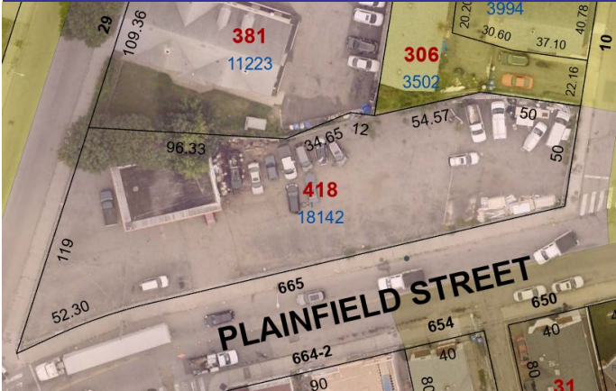
Aerial view of site