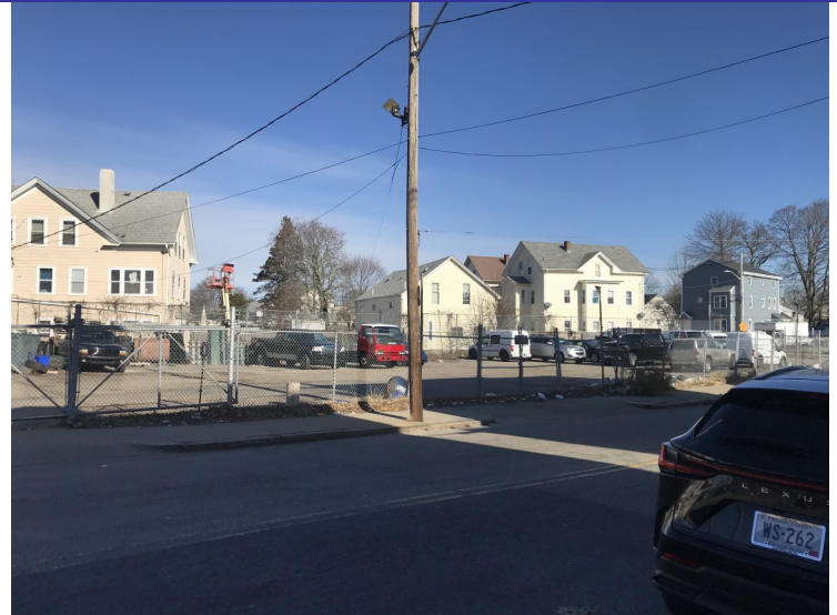
View from Plainfield Street