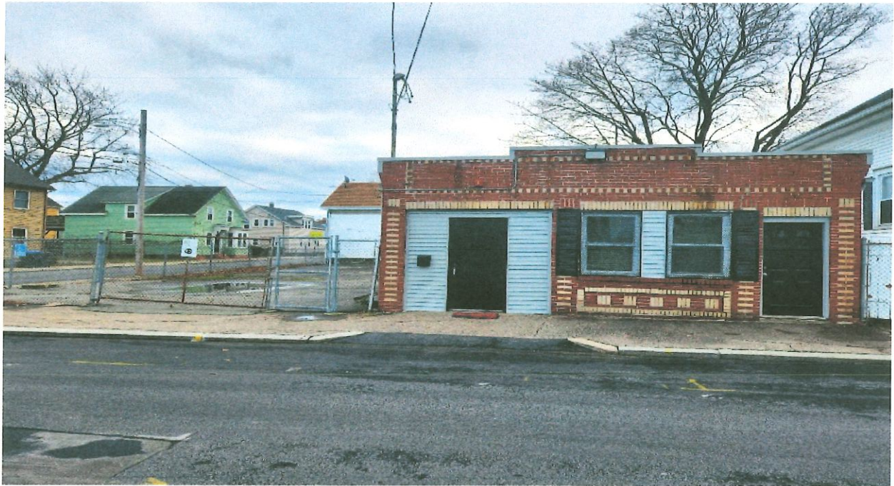
Exhibit B Property Photos