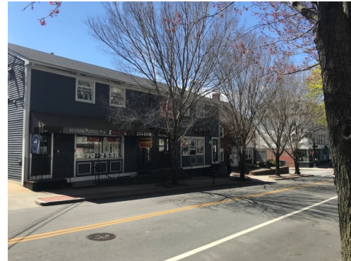
View from Wickenden Street