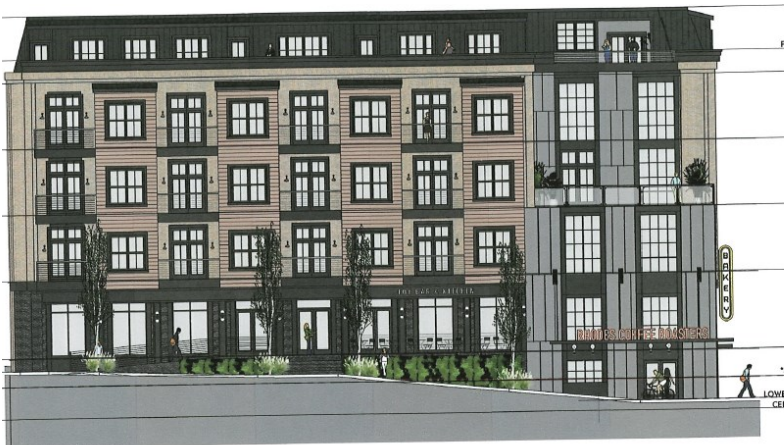
*AVERAGE GRADE OF 0'-0" IS 25'-9 1/2" ABOVE SEA LEVEL