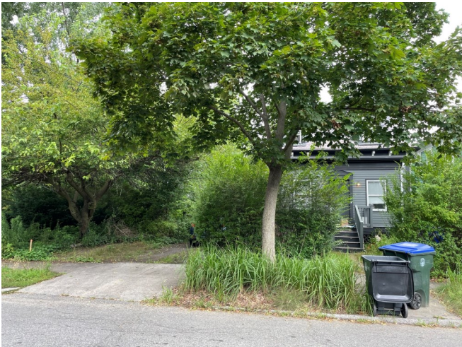
View from Congress Street