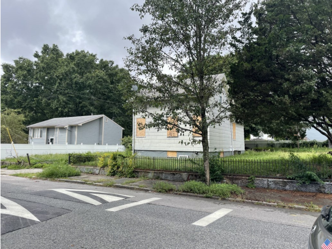
View of the lot from Job Street