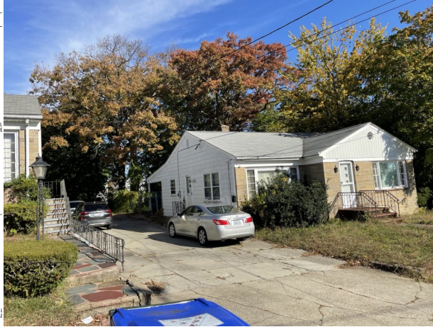
View from Pomona Ave