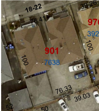
Aerial view of the site