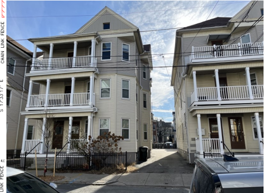
View from Grove Street