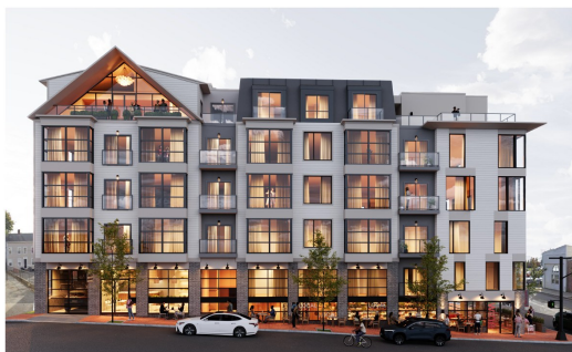
Building renderings from Brook and Wickenden Streets