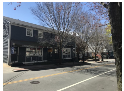
View from Wickenden and Brook Streets