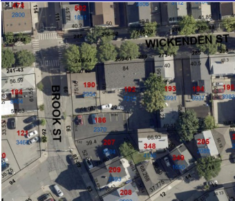
Aerial view of the site