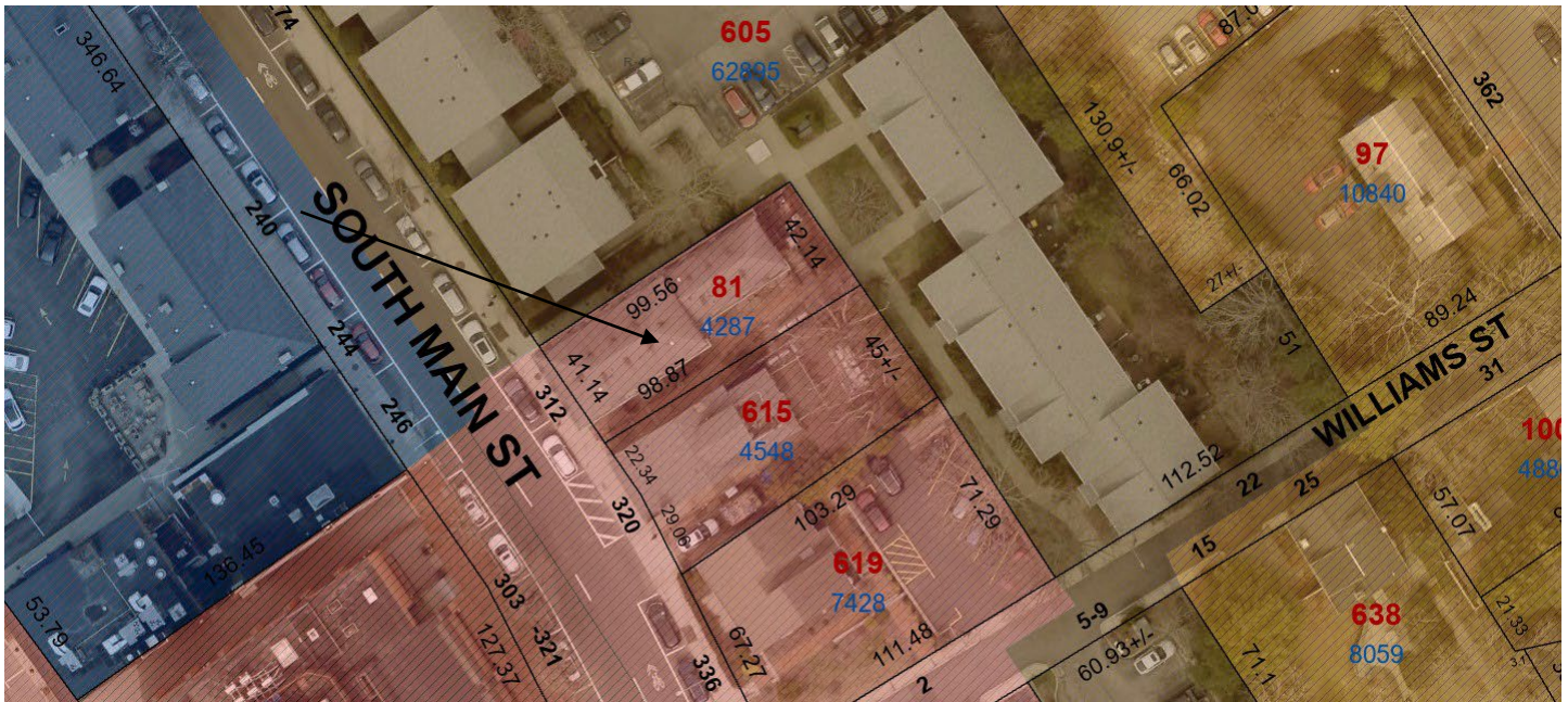
Arrow indicates 312 South Main Street