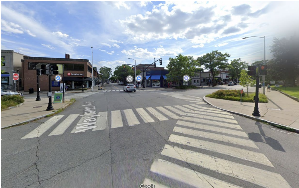
Fig. 1 – Wayland Sq Existing Conditions