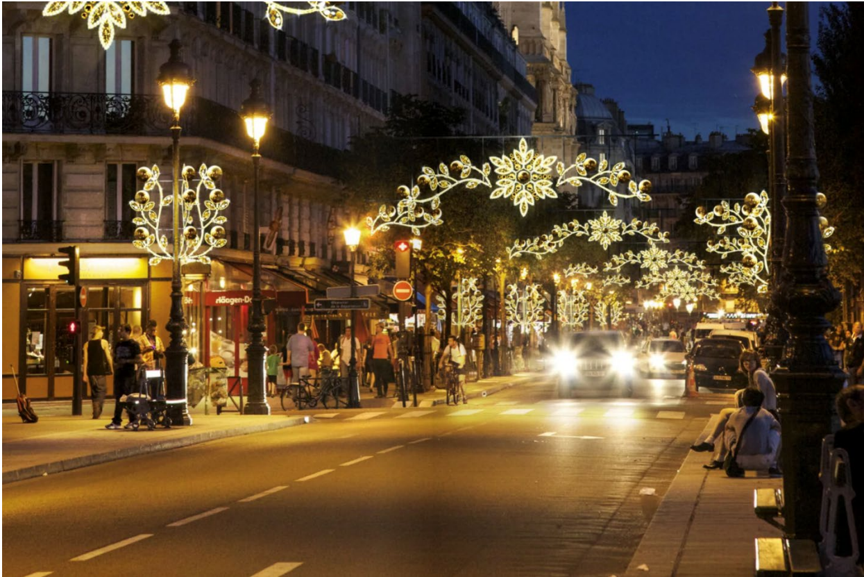
Fig. 3 – Example Decorative Elements