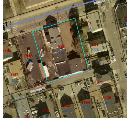
Aerial view of the site