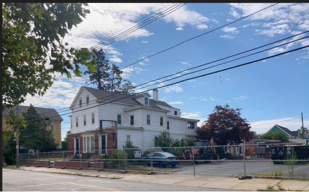
View of the site from 290 public