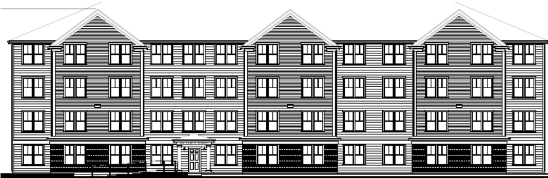
Public Street elevation